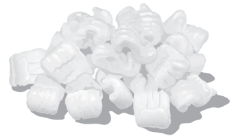
Foam Packing Peanuts