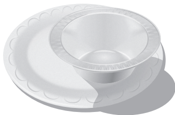
Foam Plates & Bowls