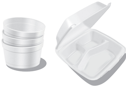
Foam Takeout Containers

As of January 1, 2019, single-service foam items will be banned from possession, sale, or use in NYC.